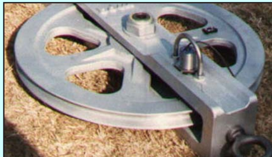
20" sheave block complete with Tcount retrofit