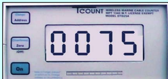
DTD254 Desktop display can be used as main display or as a repeater

** Assumes a count of 6000 revolutions every day!