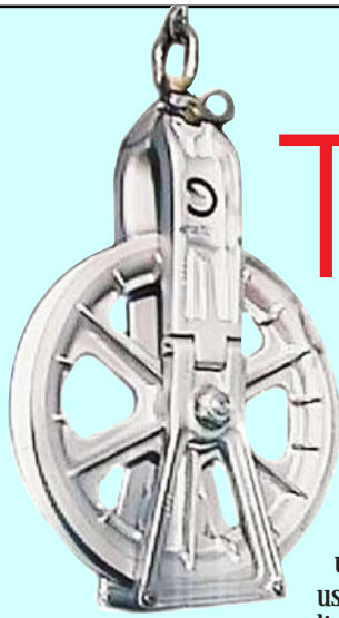
14" aluminium marine block with TX2 counter electronics, illustration only