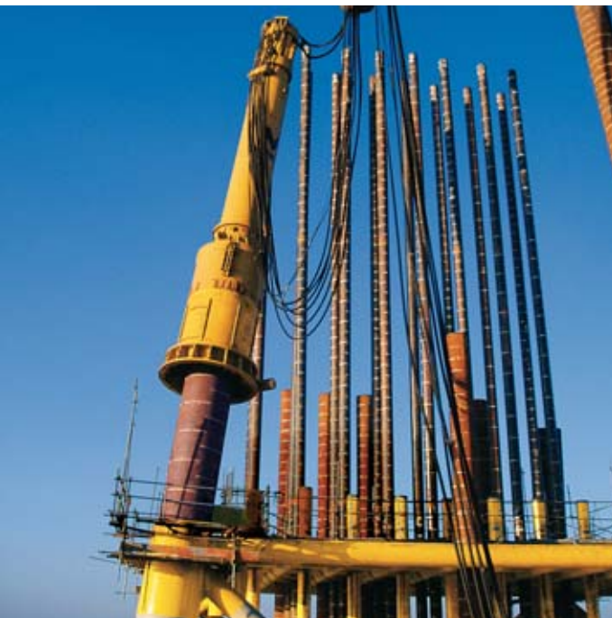
Offshore pile driving experts