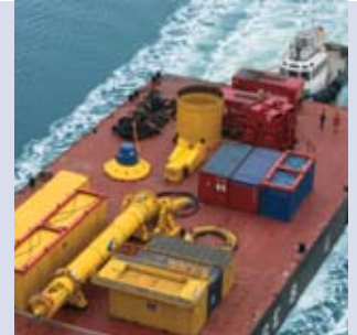
Transport & Logistics