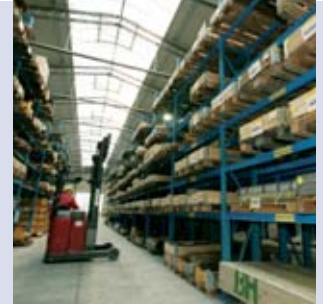
Spare parts warehouse