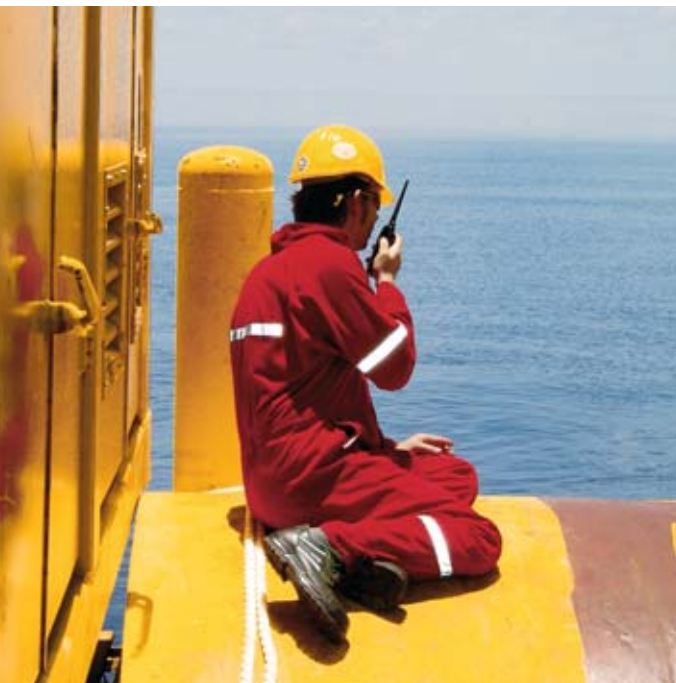
Communication is key to our success

We pride ourselves in the skill of our employees, who come from such diverse backgrounds as: