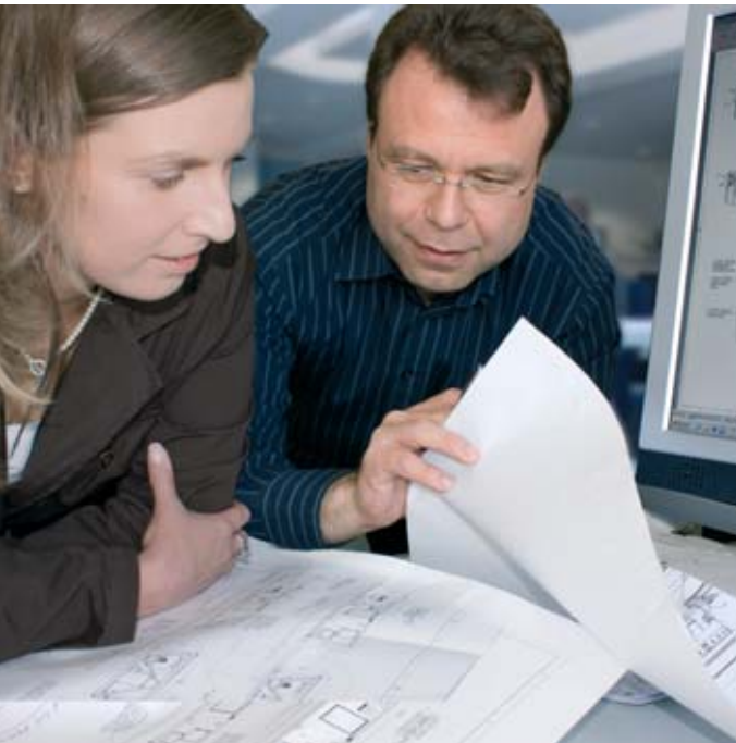
Detailed planning ensures good performance

The harsh offshore environment requires precise planning, strong design and engineering know-how to produce robust and reliable equipment.