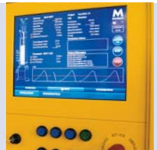
MHC monitoring and control

You've purchased a hammer system, installed your piles and now what?