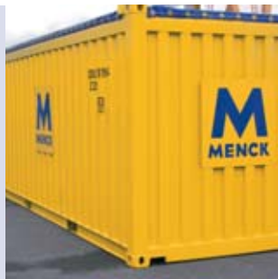
Mobile workshop container